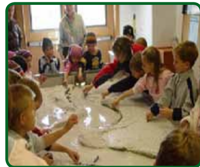
River Table Demonstration

Call today to book your field trip! 303-730-1022