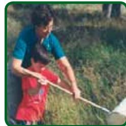
Insects & spiders

Call today to book your field trip! 303-730-1022